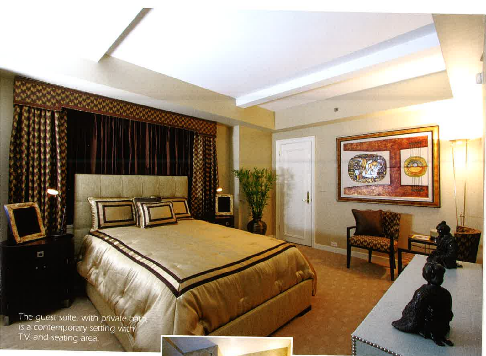
The guest suite, with private bath, is a contemporary setting with T.V. and seating area.