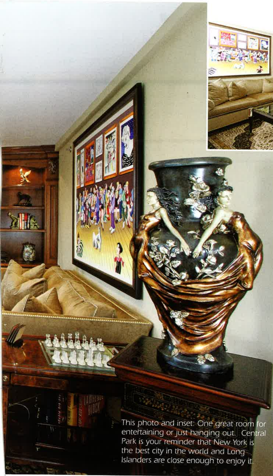
This photo and inset: One great room for entertaining or just hanging out. Central Park is your reminder that New York is the best city in the world and Long Islanders are close enough to enjoy it.