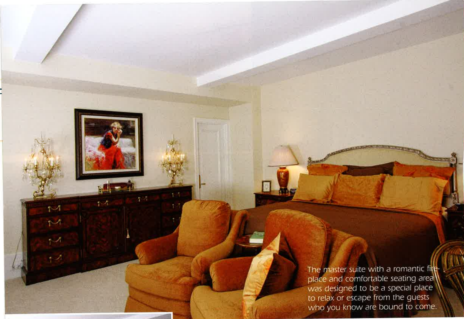
The master suite with a romantic fireplace and comfortable seating area was designed to be a special place to relax or escape from the guests who you know are bound to come.